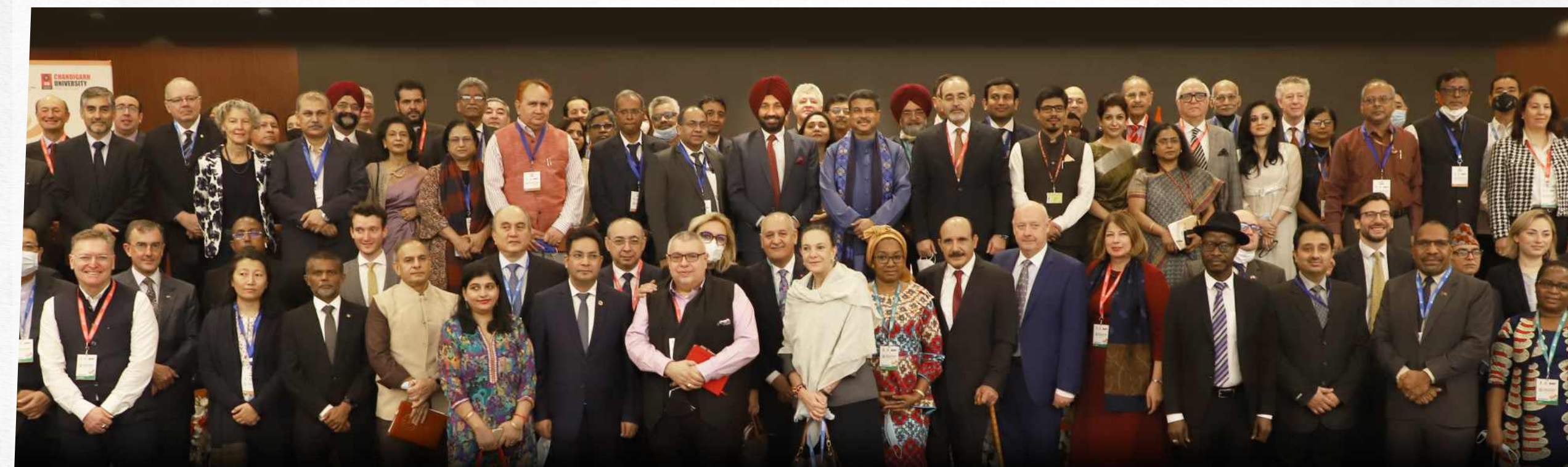
LARGEST CONGREGATION OF FOREIGN DIGNITARIES CHAMPIONING THE COURSE OF HIGHER EDUCATION FOR GLOBAL PROSPERITY